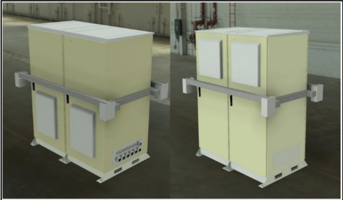
Dual Bay Cabinet – Front & Back View