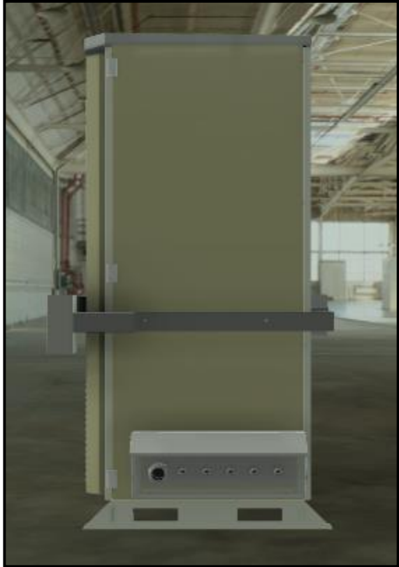
Equipment Cabinet – Side View