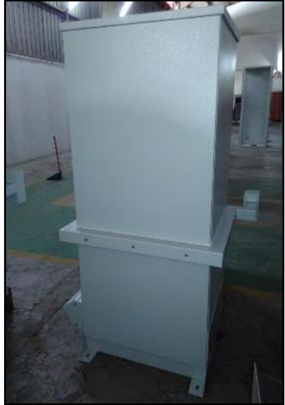
RRU Cabinet – Side View