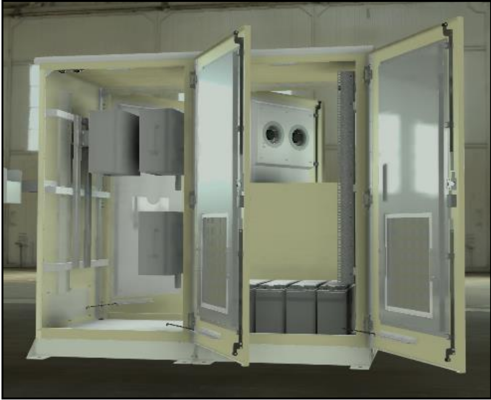
Dual Bay Cabinet – Internal View