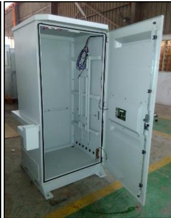
RRU Cabinet – Front View