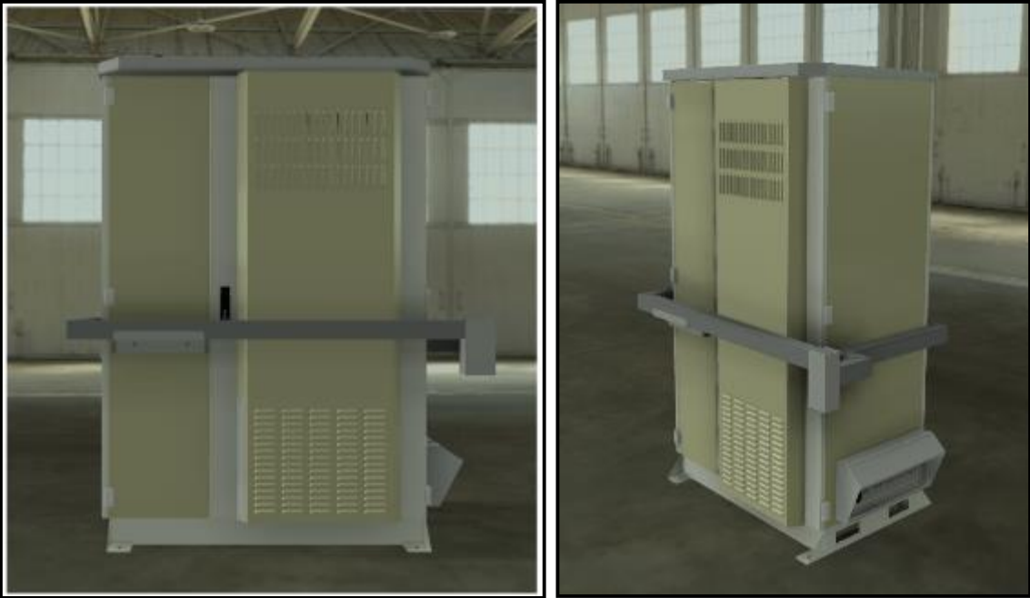
Equipment Cabinet – Front View