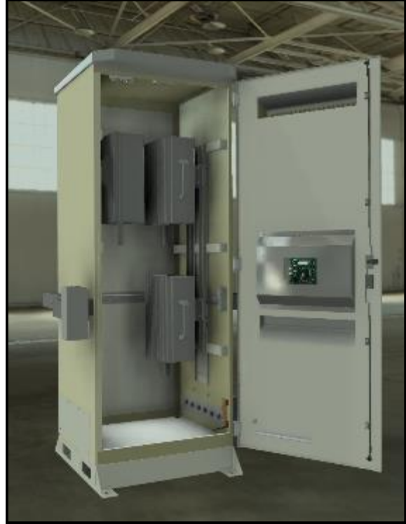
RRU Cabinet – Side View