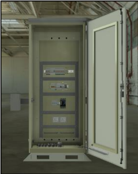
Equipment Cabinet – ACDB View