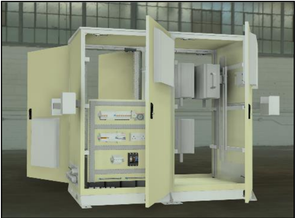
Dual Bay Cabinet – Rear View